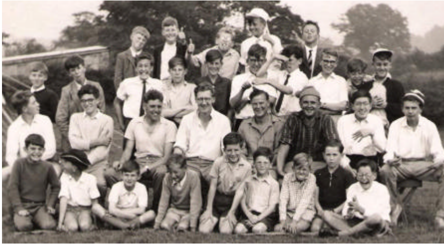
Choir Camp circa 1959-60

It is with considerable regret that we advise members that the traditional annual choir camp will no longer take place in its current form. After extensive consultations the Dean and Chapter has decided that because of the lack of succession in camp leadership and staffing, coupled with the constraints of HSE and Child Protection legislation, it can no longer support the camp. Possibly this will be a great disappointment to those who have enjoyed and, indeed, helped to run the camps over the 50 years it existed but assurances have been given that suitable alternatives for current and future choristers will be found.